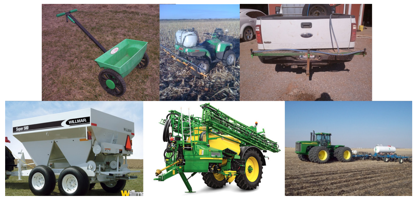
Figure 2. Equipment used for N-Rich Strips. From top-left to bottom right: Push spreader, ATV with 10-foot spray boom, receiver hitch mount with trigger in cab, dry fertilizer spreader, sprayer pull or self-propelled (often only use middle section) and anhydrous applicator.