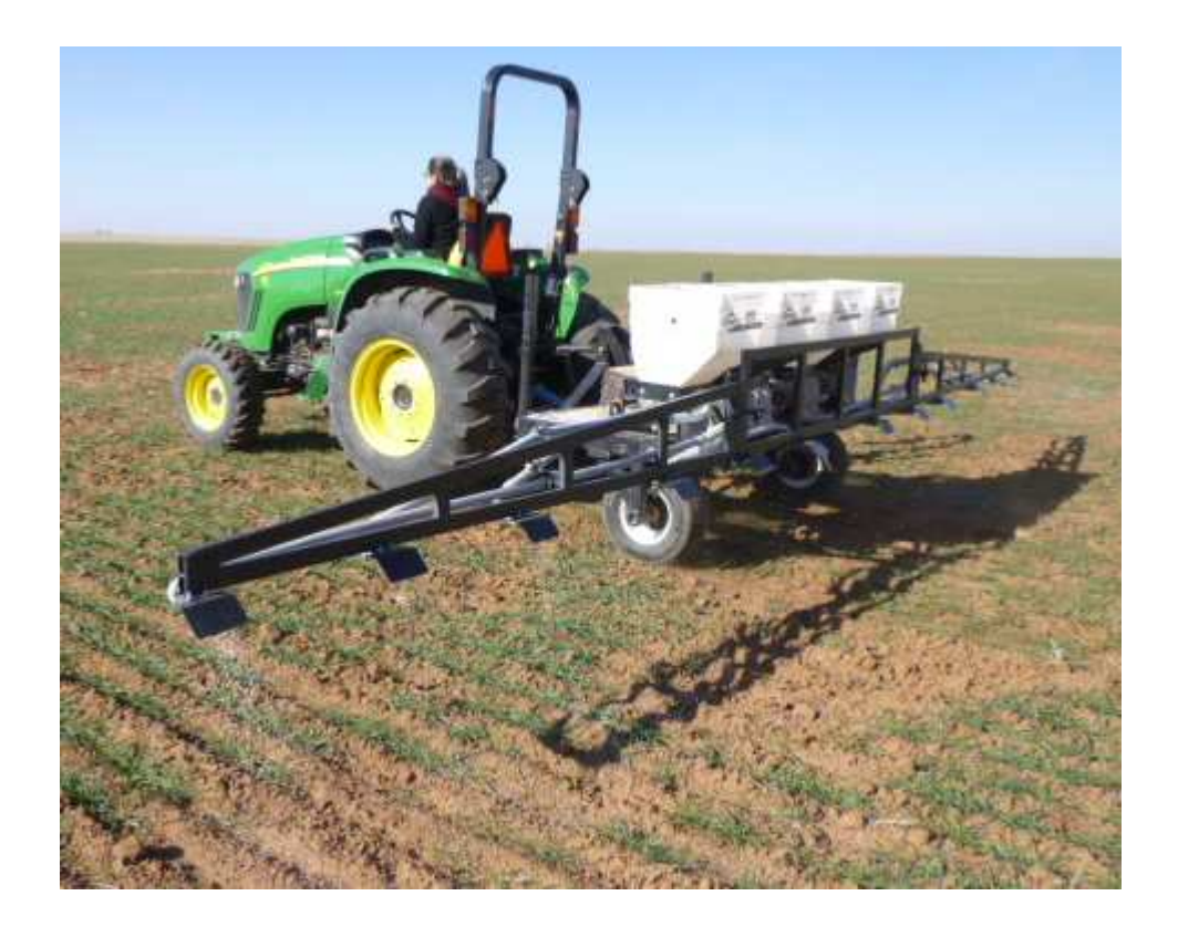
Figure 1. Application of NPKS rich strips with an applicator built by engineers at Oklahoma State University, containing four dry fertilizer boxes that held individual fertilizer connected to three polyvinyl chloride tubes attached to a 12 m boom. Fertilizer boxes were fed by two drive wheels as a PTO controlled fan forced fertilizer through the polyvinyl tubing to a reflection plate where it was evenly dispersed throughout a 1.8 m strip parallel to one another.