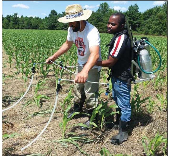
Sidedress application of liquid urea ammonium nitrate (UAN) application across plots receiving different amounts of preplant N.

The Maize-N simulation model is a subunit of the Hybrid-Maize ® simulation model. It relies on a database of rate-to-response studies paired with historic climate data to develop N rate estimates. The program predicts corn yield potential, estimates recovery efficiency of applied N fertilizers, and esti-