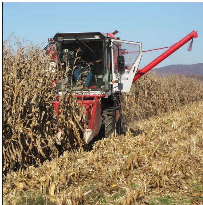
Corn plot harvest near New Kent, Virginia.

In 2014 at New Kent, the highest PFP was observed with use of the VCA at 0, 40, and 80 lb/A preplant N rates and was equal to Maize-N at the 120 lb/A preplant rate ( Figure 2a ). At Blacksburg, the greatest PFP was similarly associated with use of the VCA, but overall, PFP for the VCA at this site was less (64 lb grain/lb N) than at New Kent ( Figure 2b ). No approach consistently produced the highest PFP at Lottsburg in 2014 ( Figure 2c ), but PFP was highest at 59 lb grain/lb N for the VCA, overall. While the performance of the various sidedress N recommendations varied among sites, PFP for the VCA approach was greatest in four of seven locations and averaged 68 lb grain/lb N.